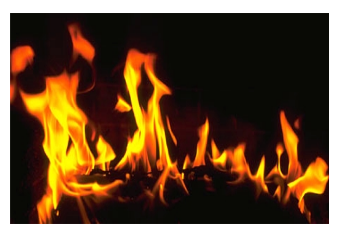
Resources for Leaders and Mobilizers of Prayer